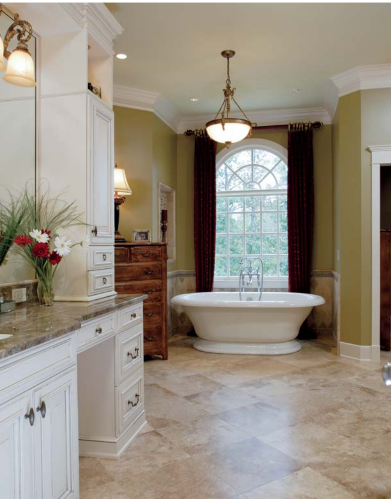
The original tub with deck was removed and replaced with an elegant free-standing tub that overlooks a private nature area.

Another wall was removed and the shower enlarged to allow in natural light. The shower door was eliminated to create a true walk-in feeling. The use of natural stone materials add to a spa feel. A large framed glass and marble mosaic area highlights the shower and is repeated in the tub area niche.